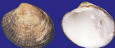
Protothaca (Leukoma) Asperrima (Sowerby) "Almeja", "Concha blanca" "Clam", "Raspilke". Lt 35.0 mm