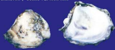
Crassostrea Columbiensis (Hanley) "Ostión" "Oyster", "Columbia Black Oyster". Lt 53.0 mm.