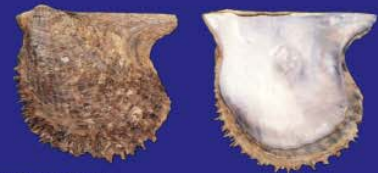
Pteria Sterna (Gould) "Concha Perla", "Almeja" "Pearl Oyster", "Western Pearl Oyster". Lt 75.0 mm.