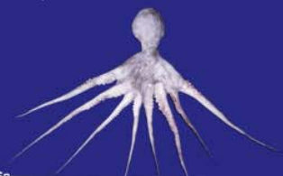
Octopus-Sp "Pulpo" "Octopus". Lt 12 c m.