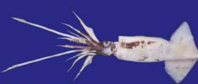
Dosidicus Gigas (Orbigny) "Calamar", "Calamar Gigante", "Jumbo" "Jumbo Flying Squid". Lt 50 cm.