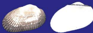
Anadara (Anadara) Similis (C. B. Adams) "Concha Macho", "Mica", "Pelada" "Ark Shell", "Cockle". Lt 52.0 mm.