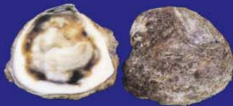
Ostrea Iridescens (Hanley) "Ostra", "Ostión de Roca" "Oyster", "Stone Oyster". Lt 150.0 mm