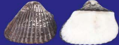
Anadara (Grandiarca) Grandis (Broderip & Sowerby) "Pata de Mula" "Grand Ark", "Cockle". Lt 100.0 mm.