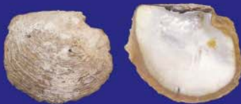
Pinctada Mazatlanica (Hanley) "Concha Perla", "Ostra Perla" "Pearl Oyster", "Mazatlan Pearl Oyster". Lt 80.0 mm