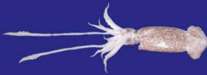
Loliopsis Diomedea (Hoyle) "Calamar" "Dart Squid". Lt 9 cm