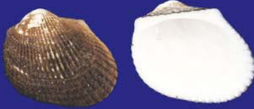
Anadara (Anadara) Tuberculosa (Sowerby) "Concha Prieta", "Concha Negra" "Black Ark", "Ark Shell", "Cockle". Lt 53.0 mm