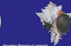
Hexaplex Brassica (Lamarck) "Caracol", "Churo Zambo" "Cabbage Murex", "Rock Shell". Lt 130.0 mm.