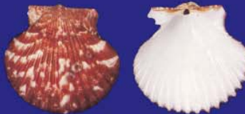
Argropecten Circularis (Sowerby) "Concha Blanca Abanico" "Pacific Calico Scallop". Lt 45.0 mm.