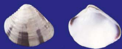
Chione (Iliochoione) Subrgosa (Wood) "Almeja", "Concha Bajera", "Concha Rayada" "Clam", "Semirough Chione". Lt 25.0 mm.