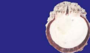
Spondylus Calcifer (Carpenter) "Ostra", "Catarro" "Donkey Thorn Oyster". Lt 130.0 mm.