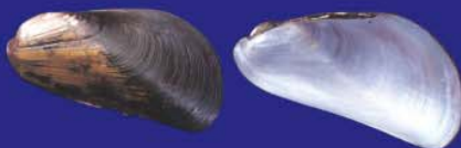
Mytella Guyanensis (Lamrck) "Mejillón" "Guyana Swamp Mussel". Lt 53.0 mm