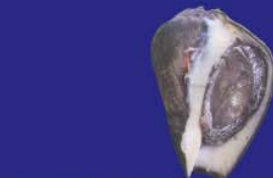
Melongena Patula (Broderip & Soweby) "pata De Burro" "Pear Shaped". Lt 140.0 mm.