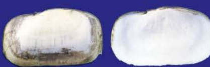
Tagelus (Tagelus) Affinis (C. B. Adams) "Almeja", "Michuya" "Clam", "Jackknife Clam". Lt 55.0 mm.