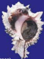
Hexaplex Regius (Swainson) "Caracol", "Churo" "Regal Murex", "Rock Shell". Lt 125.0 mm